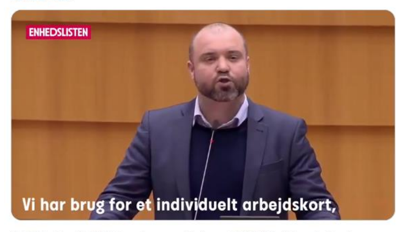
6:05 PM · Mar 10, 2021 from European Parliament ZWEIG Building · Twitter for